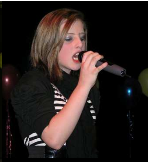
January Chi High Has Talent • over 70 girls auditioned • 24 acts performed in final to sell-out audience • £350 raised