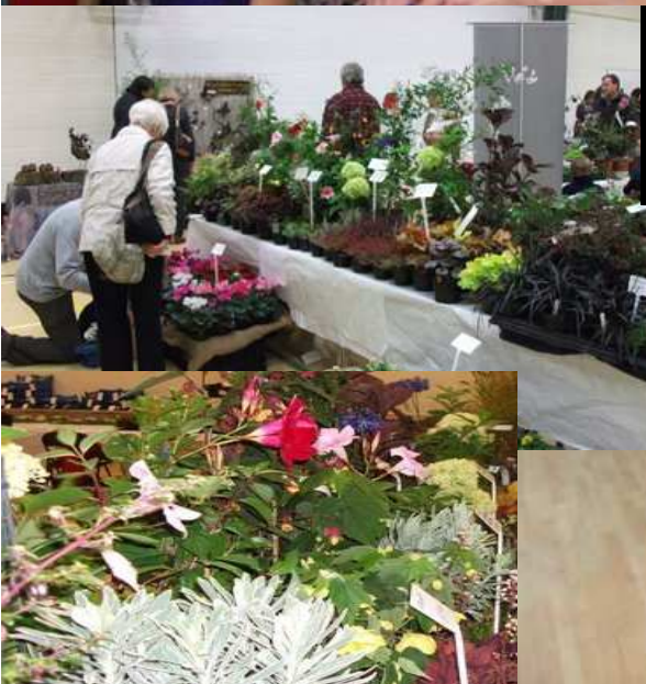
October Gardeners' Questions & Answers with Garden Market • £745 raised • audience and panellists ask "When's the next one?"