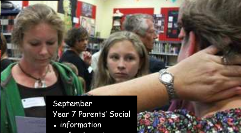
September Year 7 Parents' Social • information • refreshments • raffle