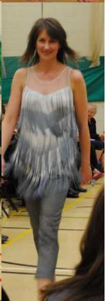
March Travelling Trends Fashion Show • Fun evening enjoyed by over 100 ladies • £928 raised