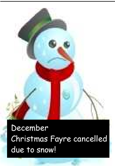
December Christmas Fayre cancelled due to snow!